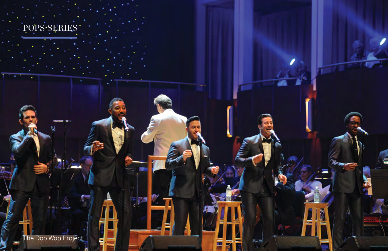
The Doo Wop Project