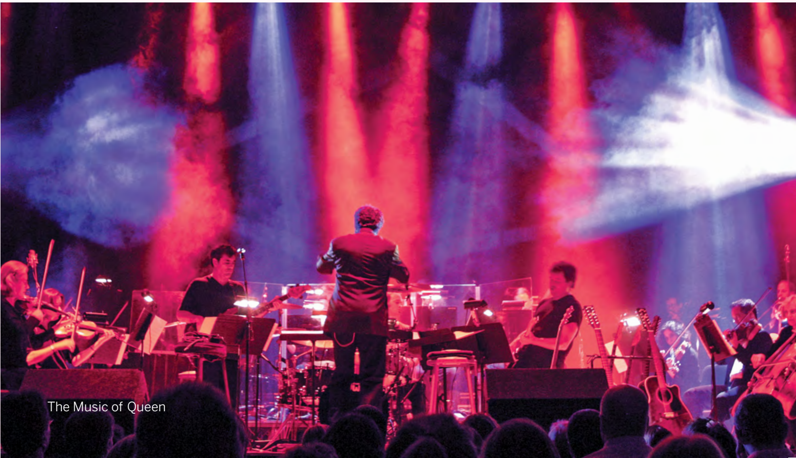
The Music of Queen

HARRY POTTER characters, names and related indicia are © & ™ Warner Bros Entertainment Inc. WIZARDING WORLD trademark and Logo © & ™ Warner Bros Entertainment Inc. Publishing Rights © JKR. (s20).